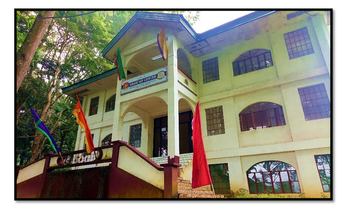
Shariah Center's Building