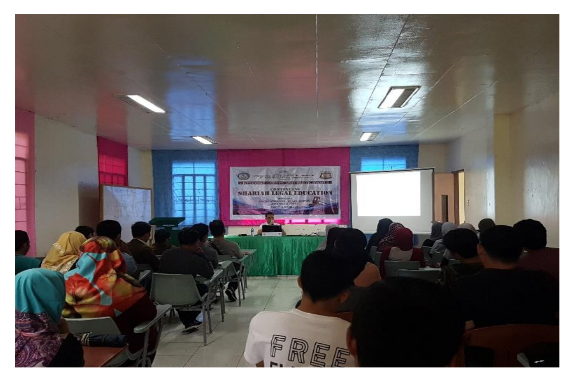
Shari'ah Center Lecture Hall/Assembly Hall