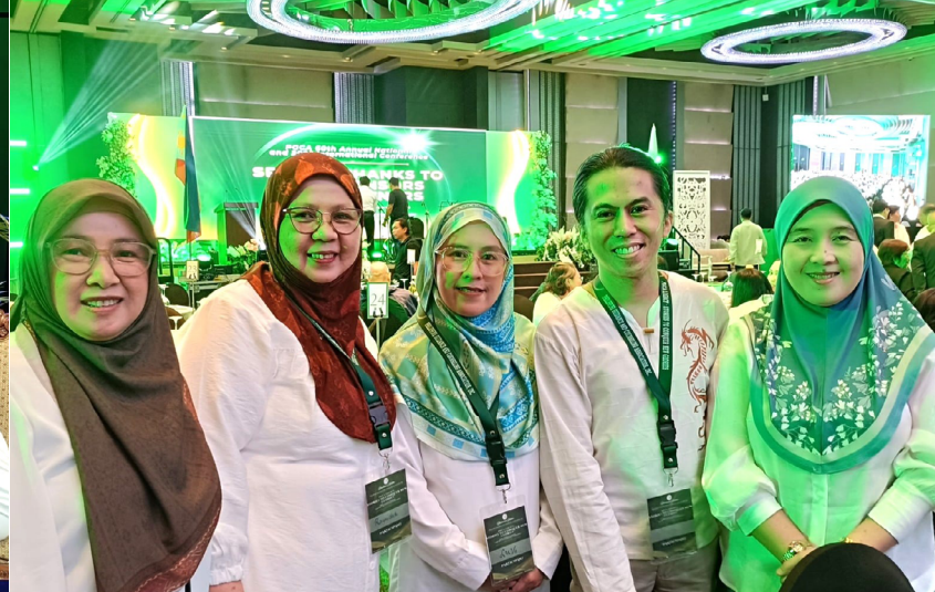
In the photos are PHWC mental Health Service Specialists and Focals during the PGCA 60th Annual National and 2025 International Conference.