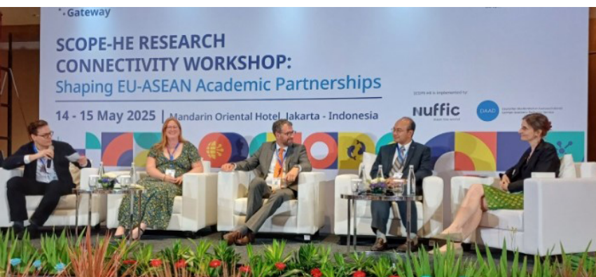
Resource Speakers of the SCOPE-HE Research Connectivity Workshop

As part of its mission, the Green Transition Cluster has set its sights on two key outputs that will drive transformative change in higher education. First, the cluster will co-develop a teaching module titled "Climate Action: Pathways to a Sustainable Future." This module, grounded in the Education for Sustainable Development (ESD) framework and informed by cutting-edge research from the partner institutions, will provide students with both theoretical foundations and practical competencies to address sustainability challenges in real-world settings. To support scalability