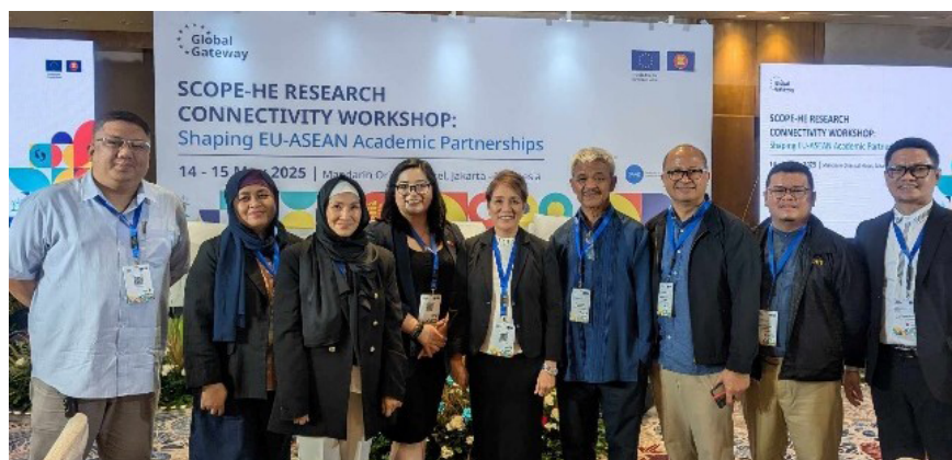
The MSU delegation at the SCOPE-HE Connectivity Package meeting with delegates from other Philippine institutions, including Xavier University and Cordillera State Institute of Technology

The Green Transition Cluster brings together six higher education institutions from Europe and Southeast Asia, each contributing unique strengths to the collaborative initiative. From Europe, the partners include Technische Universität Ilmenau in Germany, serving as the Cluster Lead; Fachhochschule Erfurt (FHE), also from Germany; and Université de Technologie de Compiègne (UTC) in France. Representing the ASEAN region are Mindanao State University (Philippines), President University (Indonesia), and Universitas Pancasila (Indonesia). Together, these institutions form a dynamic transcontinental alliance committed to fostering sustainability in education, research, and outreach.