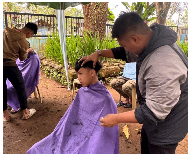
PHWC gives free haircut service to the residents of neighboring barangays of MSU.

The Center, being the premier mental health provider for the MSU Main Campus and its neighboring communities, has expanded mental health care access for the community's vulnerable constituents in the past year, reaching more than two thousand recipients of its services. With the stories of hope and resilience that our clients have shared with us, PHWC celebrates the extended mental health care that the center has provided. Likewise, we commemorate our continued services as the only healing and wellness center in the extensive region of the Bangsamoro. Panginam Healing and Wellness Center anticipates with humility and enthusiasm to continue serving the University and the community. We look forward to many more anniversaries of fostering individual healing and healthy well-being.