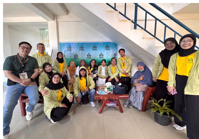
PHWC staff are celebrating a year of healing and hope.