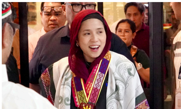
DBM Secretary Amenah F. Pangandaman

By hosting the Pagana Meranaw, MSU-Marawi has firmly established itself as a driving force in Marawi's narrative of rebirth. The university's unwavering commitment to fostering collaborative partnerships between government agencies and the local community underscores its dedication to community engagement. This remarkable cultural event not only celebrated Marawi's rich heritage but also solidified MSU's position as a key architect in shaping the city's future – a future brimming with hope, resilience, and a shared vision for a brighter tomorrow.