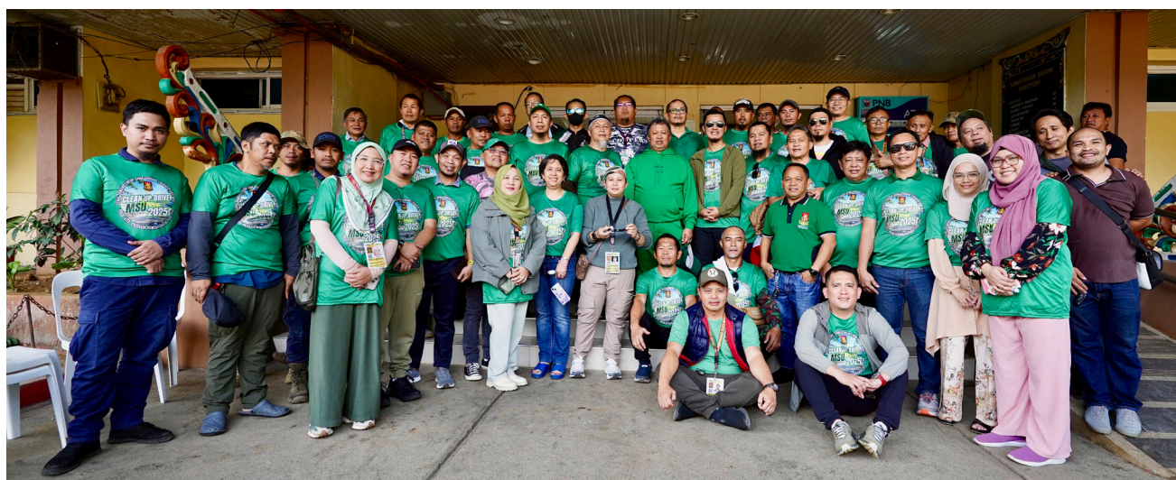
A group photo of some university officials and staff before the start of the OPLAN Linis program.

As the morning progressed, the impact of OPLAN Linis was undeniable. MSU-Main emerged from the clean-up drive not just cleaner, but inviting and more vibrant. This successful initiative serves as an example of what can be achieved when a community unites under a visionary leader to create a better future for all. The campus now stands poised to welcome students with open arms, ready to embark on a new academic year filled with promise and possibility.