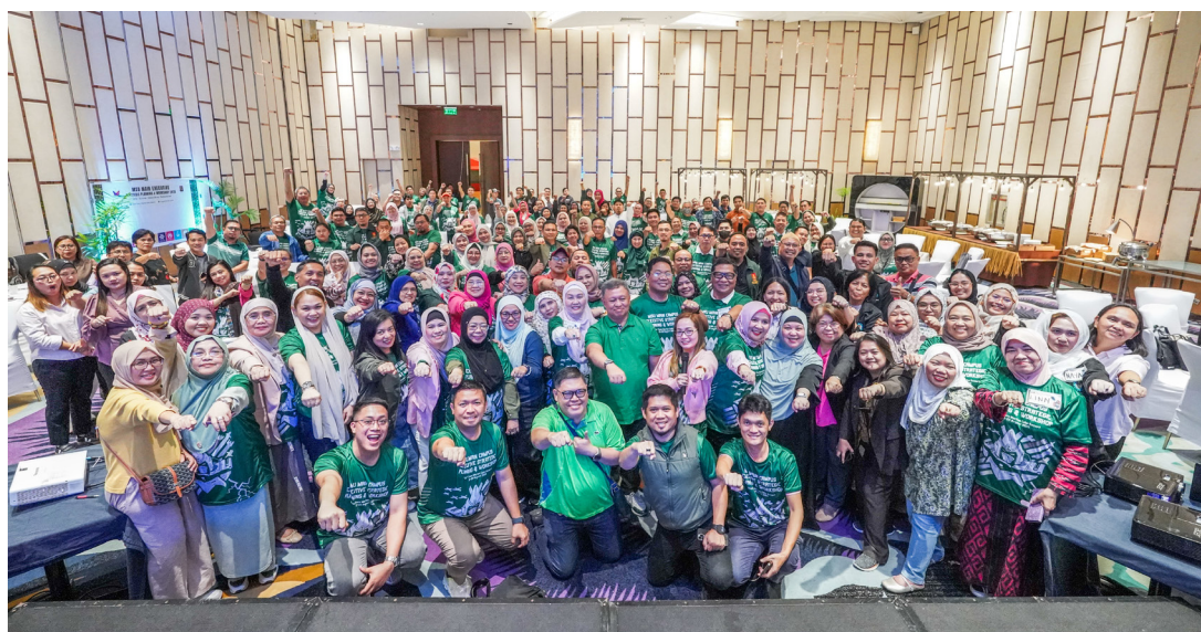
MSU System and campus officials demonstrate a powerful sense of unity with their "volt-in" sign. The gesture, made during the MSU System Strategic Planning and Workshop at the Dusit Thani Mactan Resort in Cebu, highlights their collective commitment to a unified and inclusive future for the university.

The opening day was marked by camaraderie as delegates traveled from MSU-Marawi to Cebu aboard Trans Asia Shipping Lines. Upon arrival at Dusit Thani Mactan Resort, participants were welcomed with hearty meals and an inspiring oceanfront venue that symbolized fresh perspectives and limitless opportunities.