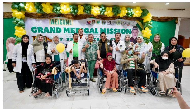
Some assistive devices, including wheelchairs, are handed over to select individuals with special needs as part of the Medical Mission.