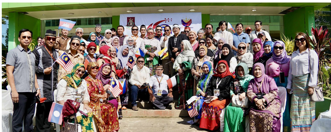
MSU System President Atty. Paisalin P.D. Tago, CPA with the MSU officials during the opening ceremony of ASEAN 2025 Celebration

The opening ceremony showcased MSU's dedication to fostering a comprehensive understanding and appreciation of ASEAN within its academic community. The event served as the catalyst for a month-long series of activities designed to promote regional cooperation, cultural exchange, and sustainable development initiatives. MSU's robust participation in ASEAN Month 2025 underscores its commitment to serving as a leading institution in promoting peace, inclusivity, and sustainable progress within the Southeast Asian region.