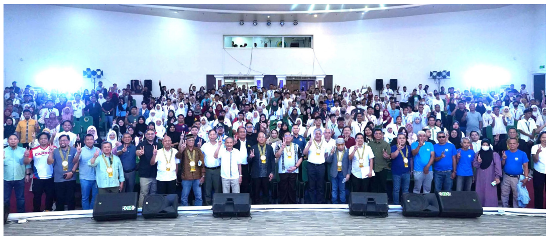
In a historic photo, all attendees stand together, marking the ceremonial awarding and release of educational assistance to decommissioned MILF combatants and their next-of-kin. The image reflects a profound moment of unity and hope, symbolizing a shared commitment to building peace and providing a new, brighter future through education.

"By providing access to quality education, we are not only empowering individuals but also building a foundation for sustainable peace and progress in the Bangsamoro." The educational assistance program is a testament to the strong partnership between the